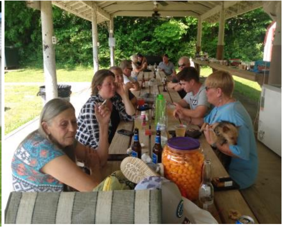
Enjoying Post Picnic