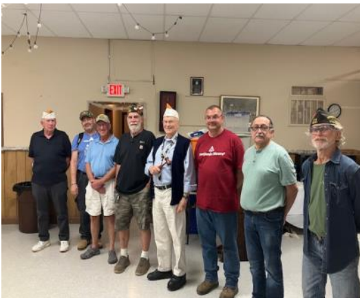
Induction of 2023-2024 Post Officers