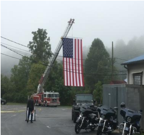
Poker Run for Canine Warriors

Chartered in August 1945, VFW Post 4309 has received an award for their 75th Anniversary. The Post celebrates holidays with the community. Visits from Santa, Easter egg hunts and plenty of trick-or-treaters. They host poker runs to benefit Canine Warriors, have post member picnics with corn hole, horseshoes, music and food. The Post grounds are open to the Boy Scouts for weekend camping and they are home to the Transylvania Honor Guard. The Post Canteen is open 364 days a year and welcomes the community to Trivia Nights and other games. VFW Post 4309 is proud to be a part of the Brevard, NC community.