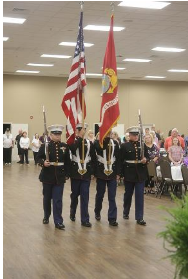
South Stokes High School JROTC Color Guard