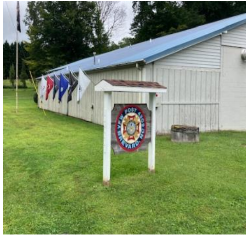
Our Post Home